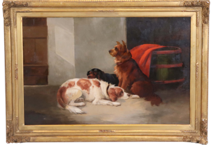
Oil on canvas painting by Edwin Henry Landseer (British, 1802-1873), titled Triple Portrait of Dogs, signed "E Landseer" lower left and dated, possibly "1864".

This press release can be viewed online at: https://www.einpresswire.com/article/557320401