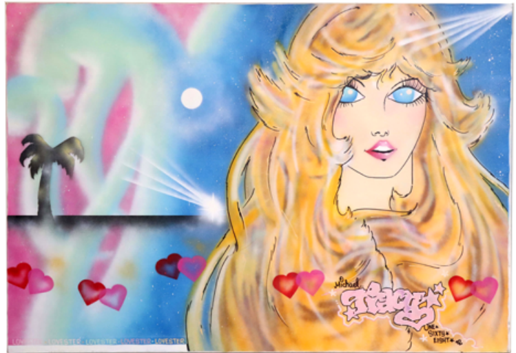
Oil on canvas painting by (Michael) Tracy 168 (American, b. 1958), titled Lovester, Lovester .

Decorative arts will include a set of dining chairs from the well-known East Hampton, New York estate Grey Gardens , owned by Edith Ewing Bouvier Beale and “Little Edie” Bouvier Beale. The chairs were part of a highly publicized 2017 estate sale. The Beales and Grey Gardens were the subject of an acclaimed 1975 documentary, a 2006 Broadway musical and a 2009 TV movie.