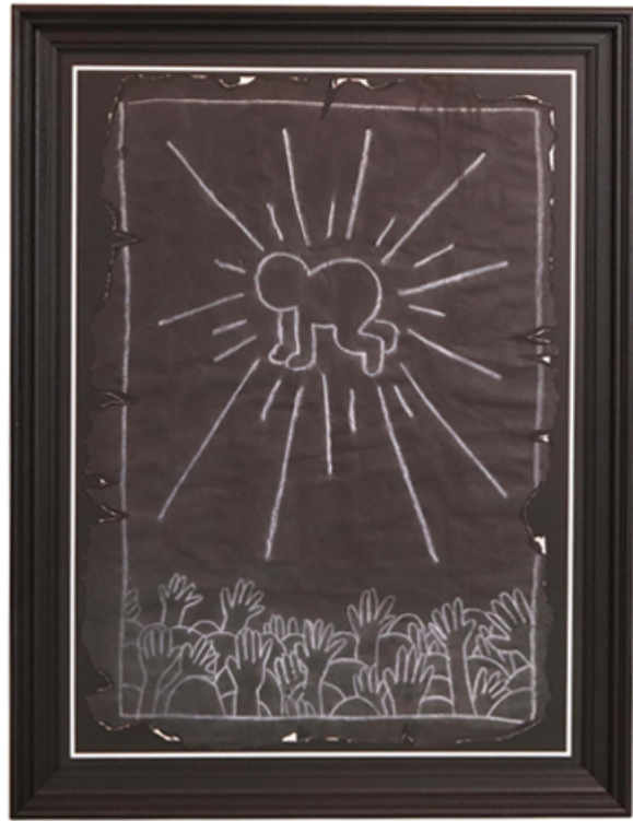
Subway drawing by Keith Haring (American, 1958-1990), circa 1982-1984.

People can bid in absentia and online. An online preview is being held now through December 15th and 16th at www.nyeandcompany.com , LiveAuctioneers.com, Invaluable.com and Bidsquare.com. Anyone looking for additional images, condition reports or info about an object is invited to visit the Nye & Company website or send an email to info@nyeandcompany.com .