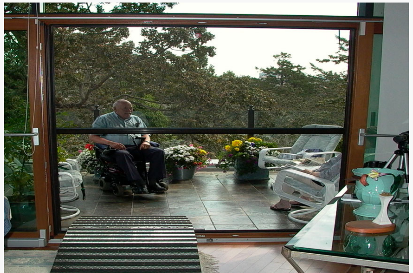
Large Motorized retractable screens