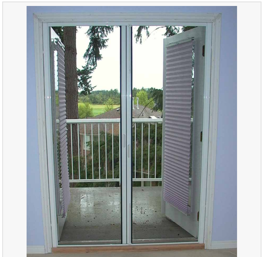
double french door retractable screens

About Bravo Screens: A global leader in the world of home furnishings. Window Treatments for your home or business - A portfolio of industry-leading and distinctive products includes Venetian Blinds, Window Blinds, Roman Shades, Wood Blinds, Wood Shutters, Plantation Shutters, French Door Cellular Shades, Vertical Blinds and Mini Blinds for any type of shape and