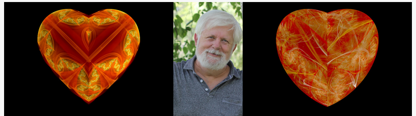
The fractal hearts are to spread love, health and happiness as NFT's