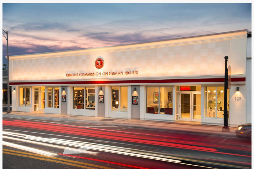
The headquarters for CCHR Florida are located in downtown Clearwater.

/EINPresswire.com/ -- The Florida chapter of the Citizens Commission on Human Rights (CCHR) is hosting a complimentary online event on December 11th. The event, Foster Kids & The Baker Act , is being held to bring attention to the flaws in the foster care system and how many of these children end up being sent for involuntary psychiatric examinations, called a Baker Act. [1]