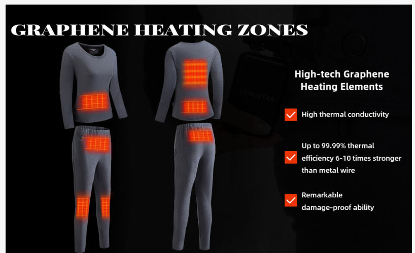
Venustas heated thermal underwear for Women