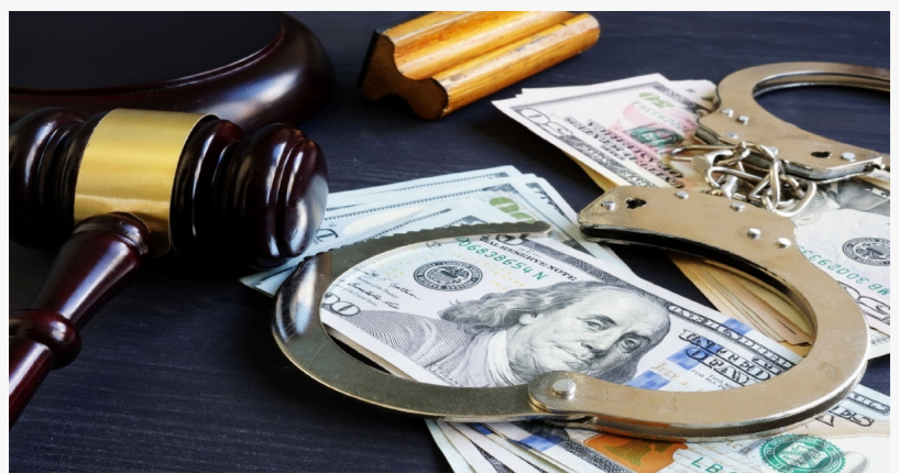
Liberty Bail Bond

To obtain a bond amount, first, the inmate must go to their arraignment where the accused is brought before the court, pleads guilty or not guilty and a judge reviews the case. It is then the judge decides based on the