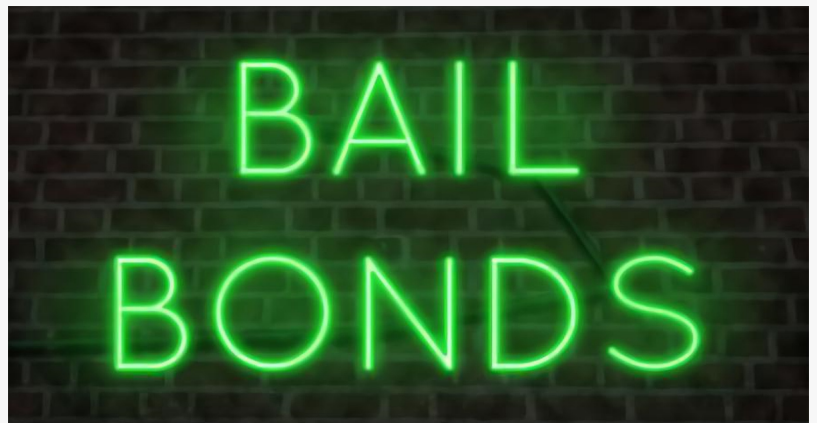
Bail Bond Service in Fort Worth

After payment is received by the courts, the bond is then posted and the inmate at Tarrant County Correction is released. This processing time ranges, in the police station release can take 1-3 hours, in the county jail the process can take 2-8 hours. Like most life situations, the busier the holding facility, the longer the release process. Shortly after the person is released from corrections, it is important to contact your agent at the bail bond office as soon as possible. The new client and agent of Liberty Bail Bond will then walk through all the paperwork required. The paperwork states the fees, expectations, rules, and requirements. A bail loan is only provided under certain conditions, such as the defendant will, without a doubt, arrive at all court dates and follow all conditions of his/her bail given by the courts. The expectations and regulations remain in effect until all court responsibilities and all payments to the Liberty Bail Bond are met. Not doing so will result in the surrender of bail to the courts and a warrant being issued for the defendant.