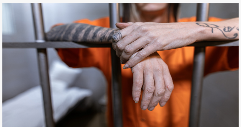
Bail Bonds in Fort Worth

severity of the case along with the crime committed if bail will be offered to the accused. The judge also decides how much the bail amount will be set based on the seriousness of the crime, flight risk, criminal history, and ties to the community. After bail is set, if assistance is required, it is time to call a bondsman within the area. In Fort Worth, the place to call is Liberty Bail Bond. In most cases, Liberty Bail Bond will ask for a fee or percentage of the bond amount to obtain a surety bond, however, there are other times they will hold a larger asset as collateral. If cost is an issue, bring it up to your agent, they sometimes offer payment plans upon request. Once Liberty Bail Bond receives their fee, they will complete the initial paperwork which takes anywhere from 15-30 minutes then pay the entirety of the bond amount to the courts.