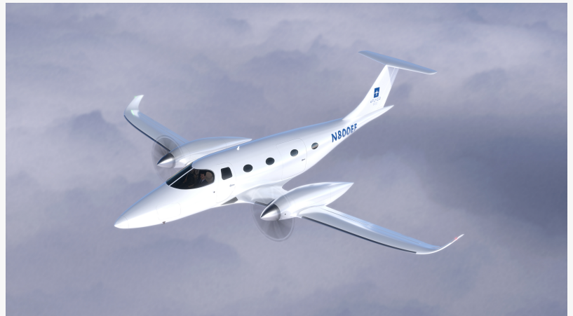
Render of eFlyer 800