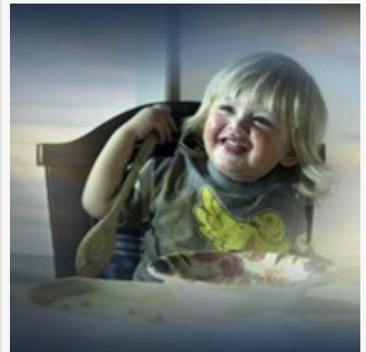
Booklet: “Children” from the “Scientology Handbook”