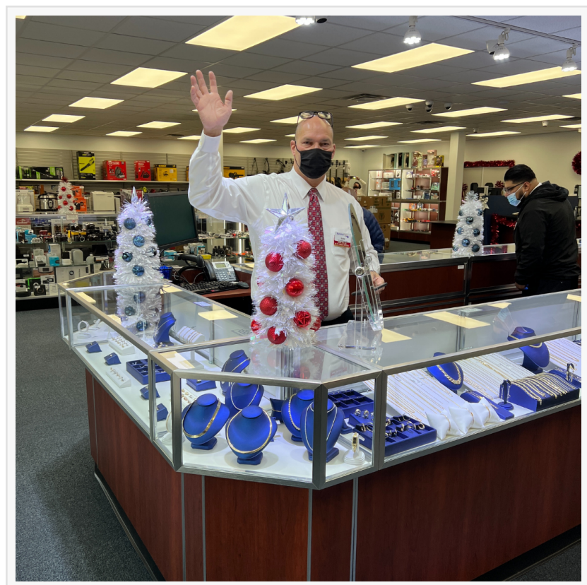
Our team at National Pawn's New Winston-Salem Store

WINSTON-SALEM, NORTH CAROLINA, UNITED STATES, December 2, 2021 /EINPresswire.com/ -- National Pawn, a Triangle-based pawn retailer with 23 locations and over 175 team members across North Carolina, opened a new store in Winston-Salem today. Located at 1511 S Stratford Road, team members say they're ready to welcome holiday shoppers through the doors with a wide variety of fine jewelry, electronics and game systems, tools, designer luxury items, and more.