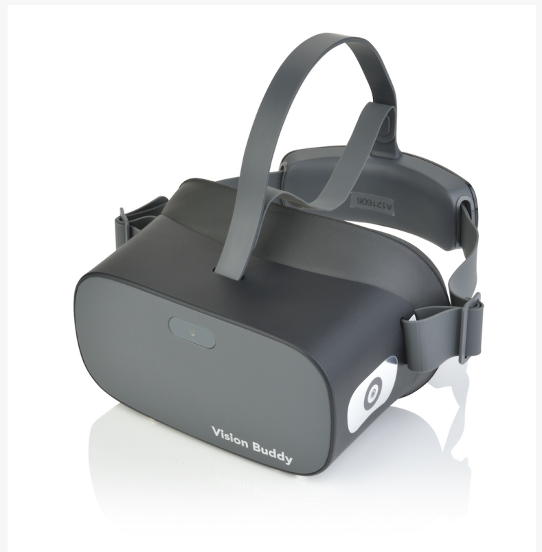
Vision Buddy headset

This press release can be viewed online at: https://www.einpresswire.com/article/557416500 EIN Presswire's priority is source transparency. We do not allow opaque clients, and our editors try to be careful about weeding out false and misleading content. As a user, if you see something we have missed, please do bring it to our attention. Your help is welcome. EIN Presswire, Everyone's Internet News Presswire™, tries to define some of the boundaries that are reasonable