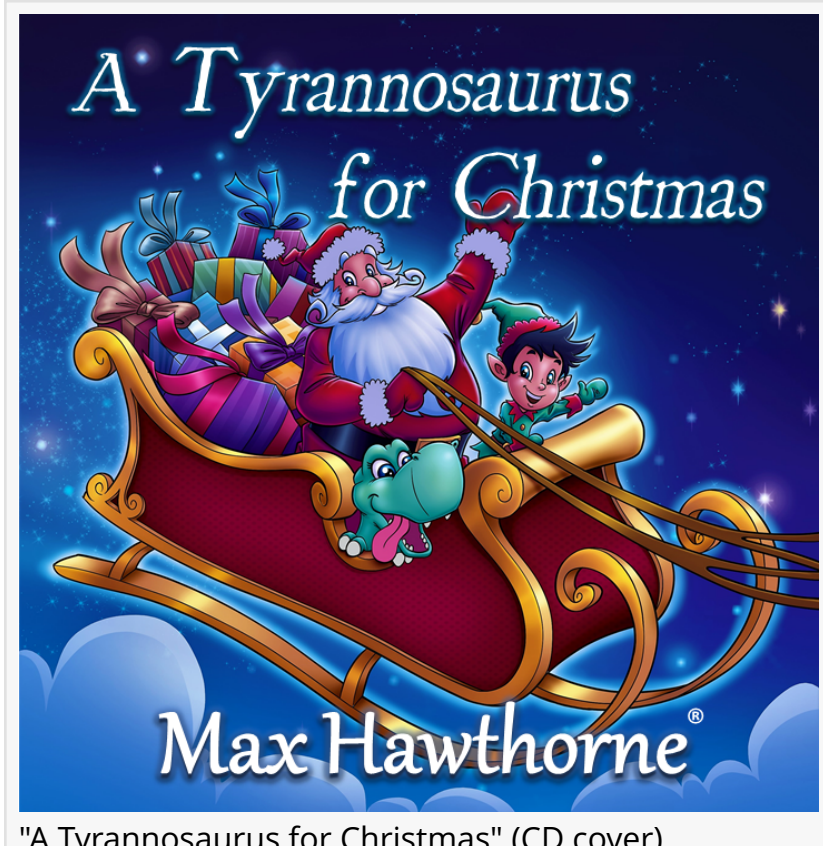
"A Tyrannosaurus for Christmas" (CD cover)