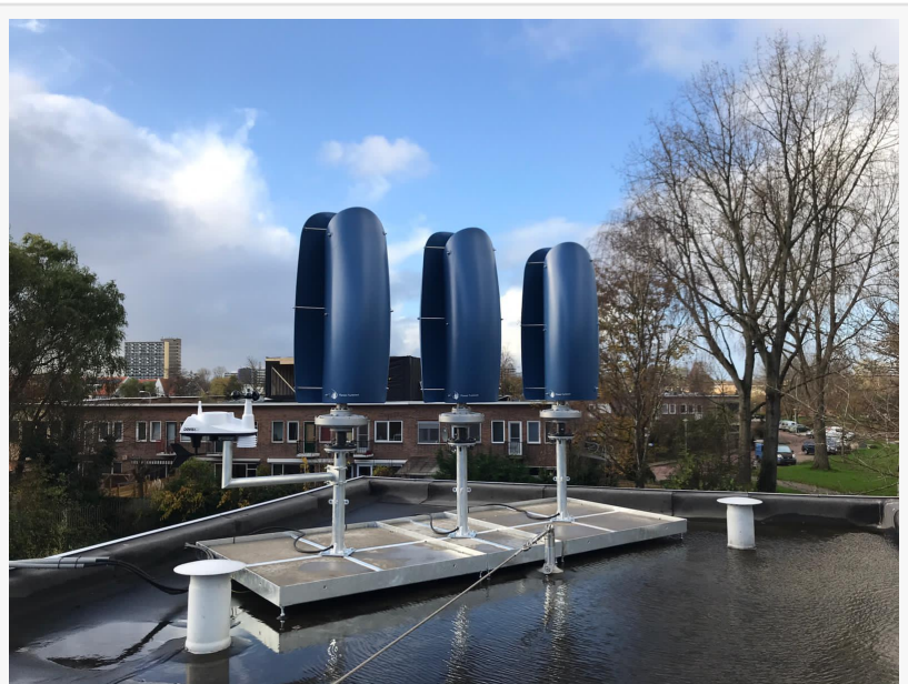
Three installed small size Wind Tulips

beautiful, efficient, and which make their neighbors perform better. The company has a complementary product line of on and off grid e-bike charging stations. The Flower Turbines technology is based on multiple granted and pending patents. Flower Turbines has growing sales of its products in Europe and is planning its US manufacturing.