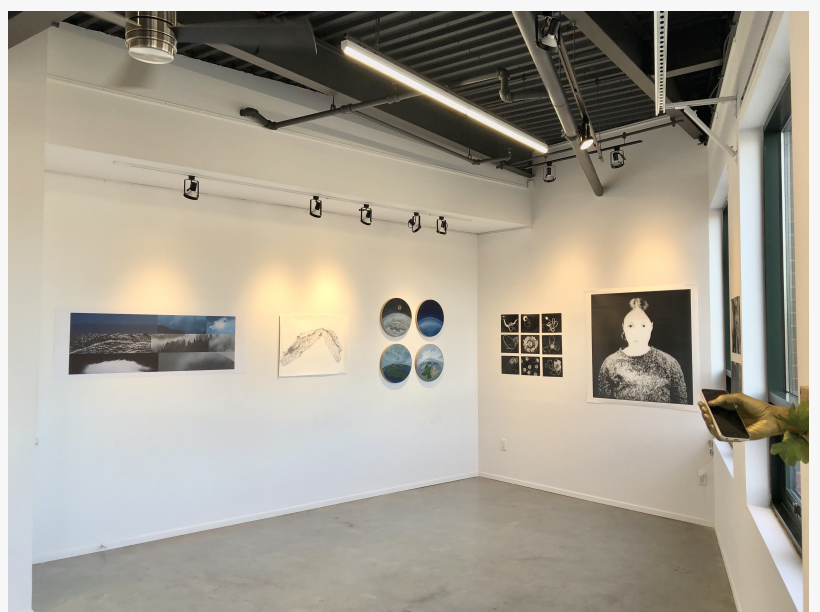
Installation Image of UQAM Exhibition

“These events highlight the ways @shimartnetwork has created new possibilities for both digital and analog hosting of high-quality art often overlooked by traditional galleries.”