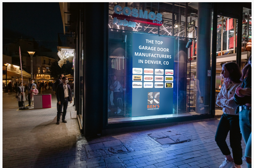
car key and remote replacement