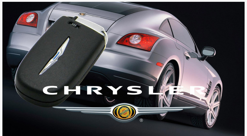
Chrysler remote key replacement