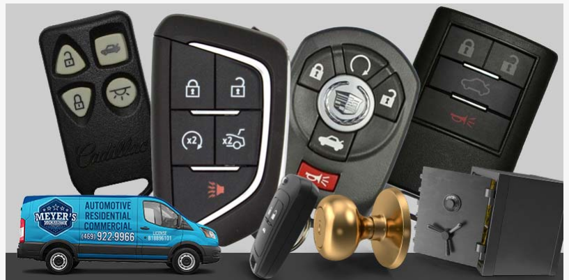
Car keys evolution