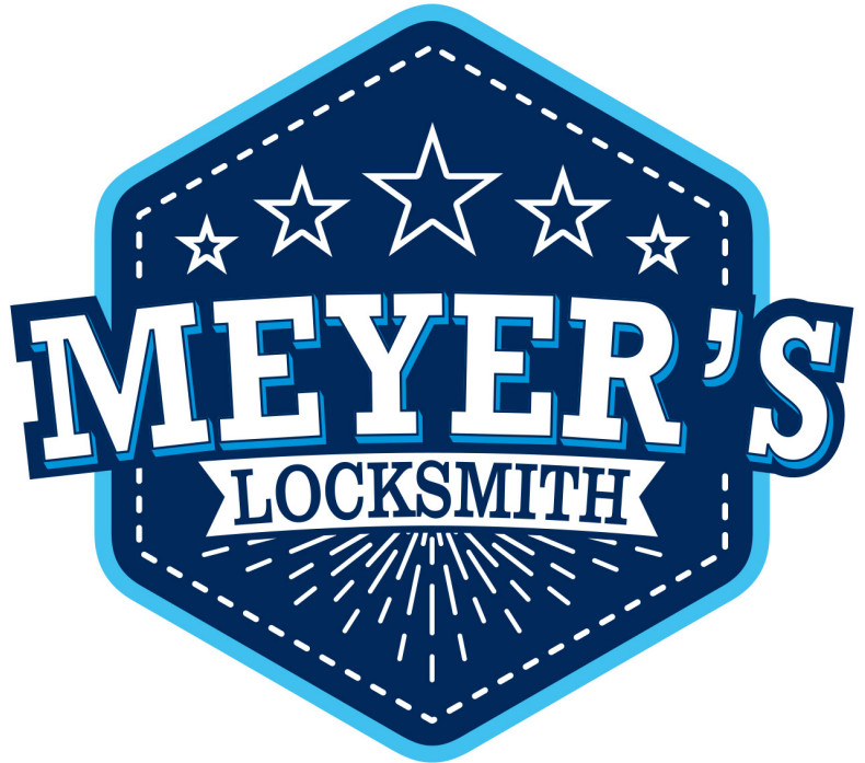
McKinney Locksmith Services

Meyer's Locksmith has been a trusted name in the industry. They are known for providing high-quality locksmith services that meet or exceed customer expectations, which is why they've earned themselves an excellent reputation over time!