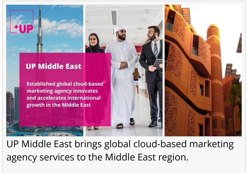
UP Middle East brings global cloud-based marketing agency services to the Middle East region.

DUBAI, UNITED ARAB EMIRATES, December 7, 2021 /EINPresswire.com/ -- UP THERE, EVERYWHERE , the world's first full-service global cloud-based agency, is not only up there, but now also on the ground with a firm footprint in the Middle East. Headquartered in Sweden with a connected group of marketing professionals all around the world, the UP Middle East team provides every marketing service that companies need to differentiate themselves and achieve success in the Middle East and globally.