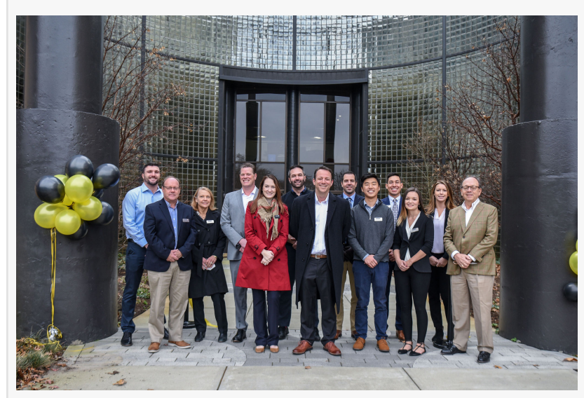
Freedom Energy Logistics team members celebrate the opening of the Westborough, MA office.

Power net metering group. Under the recently approved HB315 in NH, municipalities in the state of NH have a tremendous opportunity to take advantage of these renewable resources.