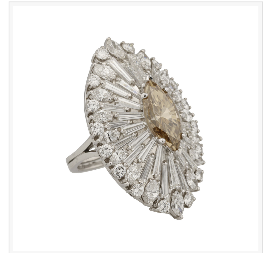
Platinum 15.45 carat diamond cocktail ring with a claw-set marquise-shaped cut diamond, fancy yellowish brown, weighing 4.32 carats (CA$29,500).

A circa 2013 Cartier Tank Américaine lady's watch with an elongated, 27mm, 18kt white gold case curvier than the original model, to which diamonds were added to create a more impressive presence, rang up $10,620. Also, a Cartier 750kt rose and white gold lady's hand-assembled bangle bracelet with a fold-over clasp and bright polish finish, modified to include cross-intersecting bands of diamonds set in white gold, hammered for $10,030.