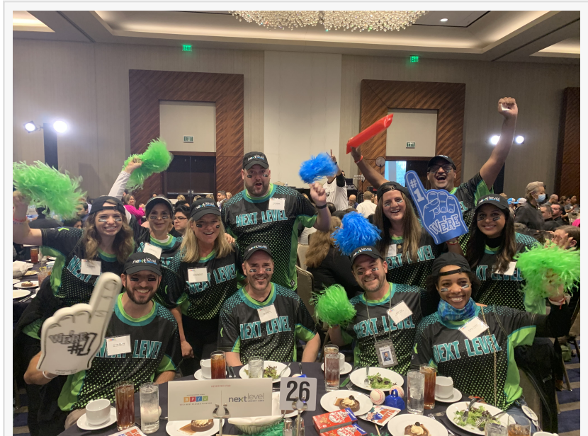
Next Level Urgent Care, Houston Business Journal Best Places to Work and Team Spirit Award Winners