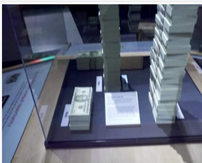
A representation of the racial wealth gap (MOSH)