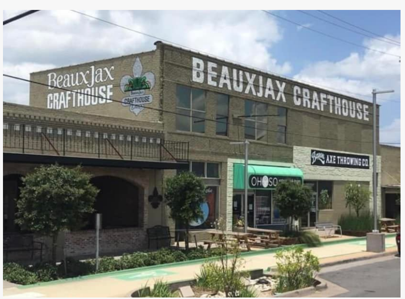
Beauxjax Crafthouse in the Bossier City, LA. Eastbank District