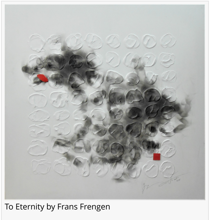
To Eternity by Frans Frengen

using real fire, ashes, and soot, honest conversations around environmental conservation have been ignited, bringing into view so much that our world is suffering a loss.