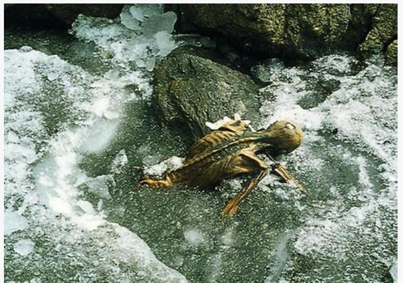
Otzi the Iceman frozen into the glacial ice