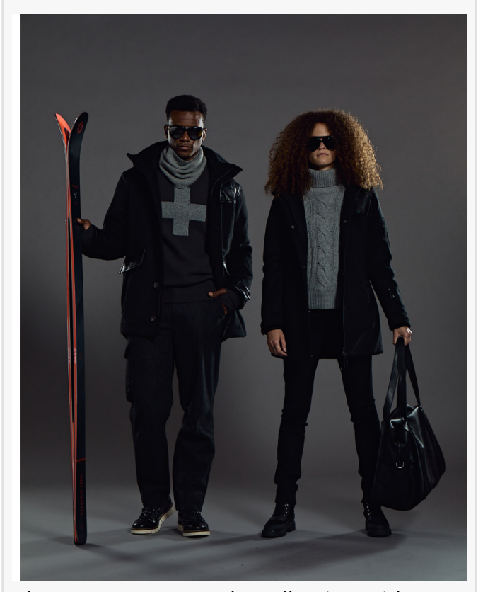
Alps & Meters Capsule Collection with Loro Piana Fabrics