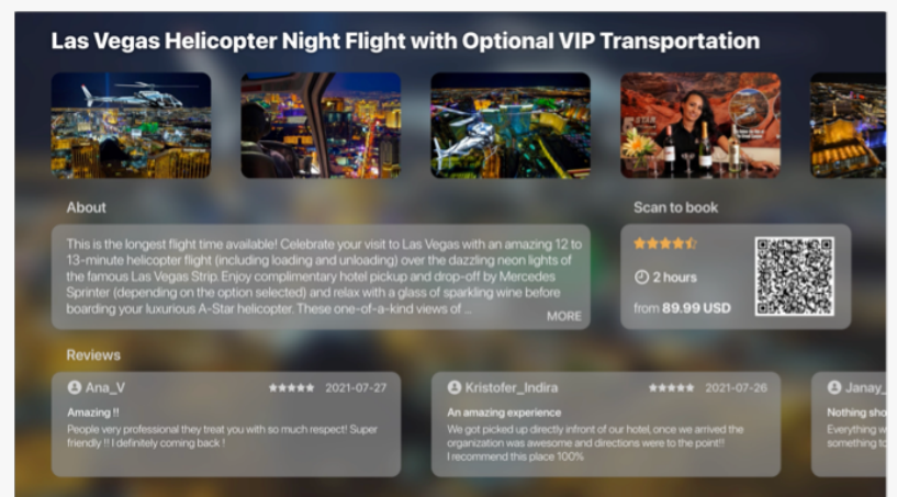
Activity detail screen from Apple TV