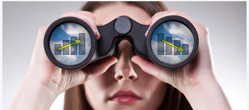
Top 5 Cybersecurity Predictions