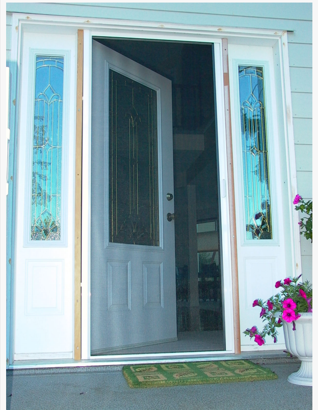
front door retractable screens large