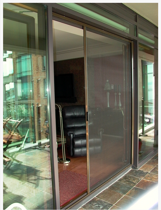
large motorized retractable screen

"At Bravo Screens the home is undoubtedly your greatest investment. Any efforts to increase its