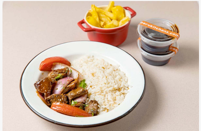
Peruvian Wok - Peru's famous Lomo Saltado