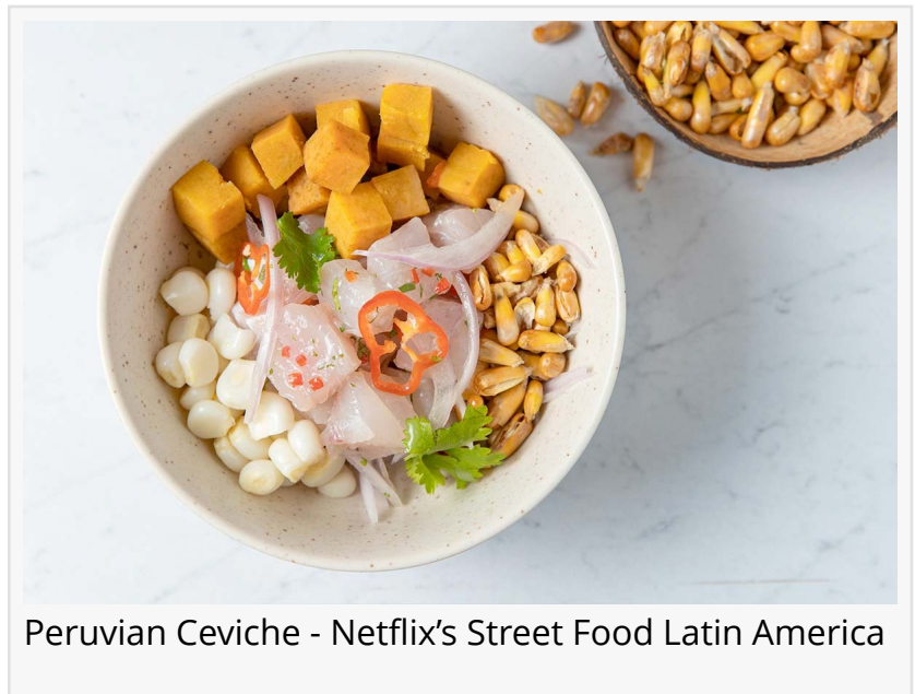
Peruvian Ceviche - Netflix's Street Food Latin America