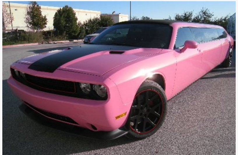
best Pink Limo Rental Austin Texas