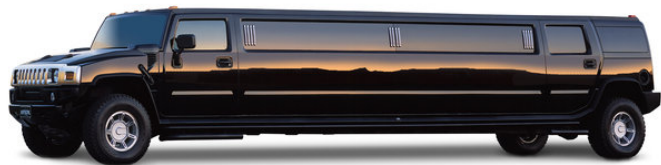
best Austin Hummer Limo Rental