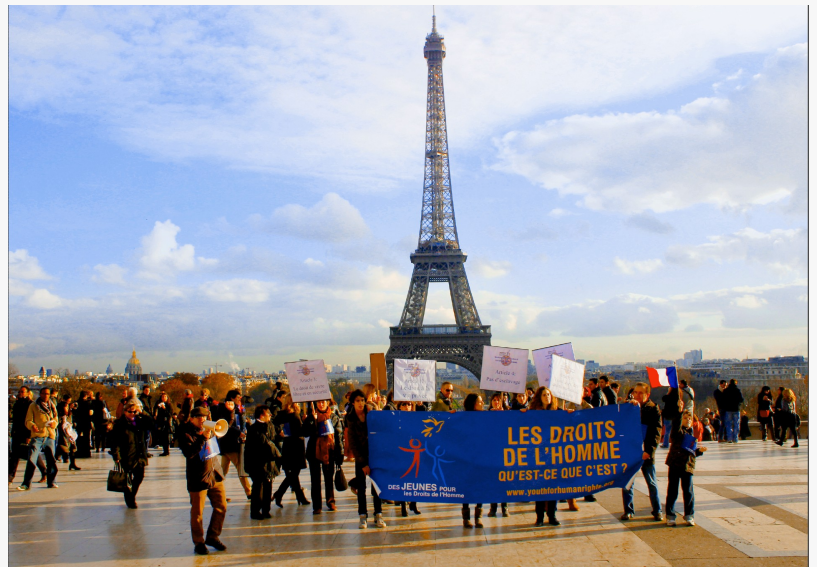
Each year on Human Rights Day, Youth for Human Rights organizes events to promote the Universal Declaration of Human Rights