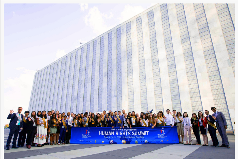
Youth delegates to the 14th annual Human Rights Summit organized by Youth for Human Rights International at the United Nations in New York

In 2001, Shuttleworth, a lifelong human rights advocate and educator, was deeply troubled by the state of human rights in the post-9/11 world. Learning that 90 percent of those surveyed were unable to name more than three of the 30 rights granted by the Universal Declaration of Human Rights she