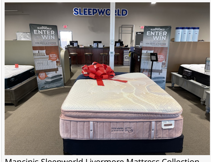
Mancinis Sleepworld Livermore Mattress Collection

This newest store highlights Mancini's Sleepworld's new <u>SleepMatch system</u> which measures