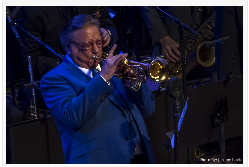
acclaimed Cuban Jazz legend and Presidential Medal of Freedom recipient, Arturo Sandoval