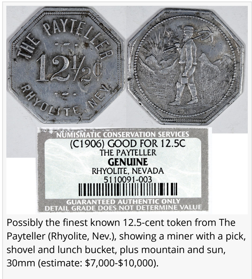
Possibly the finest known 12.5-cent token from The Payteller (Rhyolite, Nev.), showing a miner with a pick, shovel and lunch bucket, plus mountain and sun, 30mm (estimate: $7,000-$10,000).

Offerings from the Bill McIvor Nevada token and medal collection are not to be missed. They include the centerpiece of his collection: possibly the finest known 12.5-cent token from The