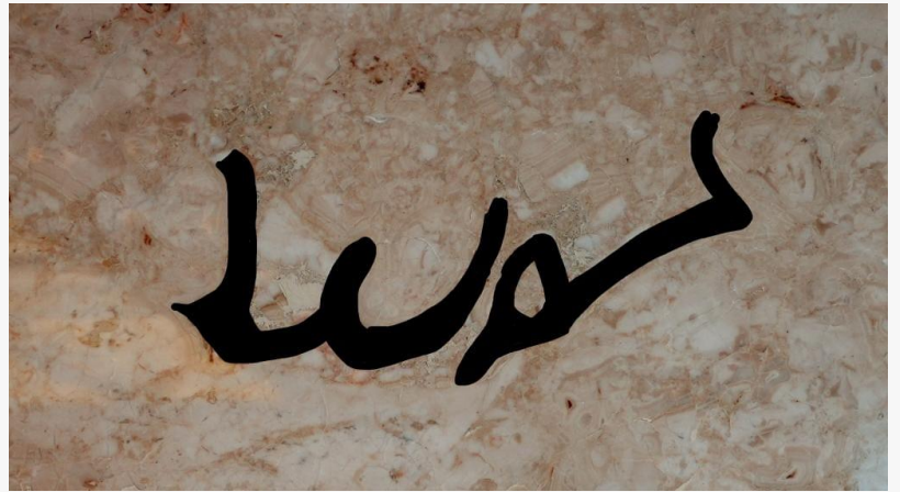
Image on the Marble