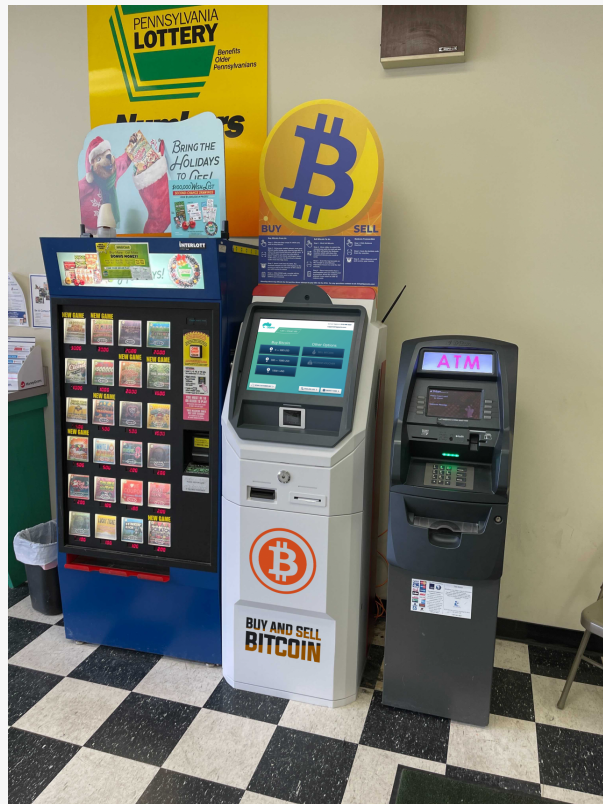
Bitcoin ATM - 1226 Liberty St, Allentown, PA 18102