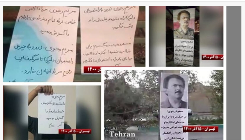
Tehran – Activities of the Resistance Units and supporters of the MEK – Maryam Rajavi: Let's spread the voice of freedom, the voice of uprising, and the chant of 'I am for regime change' – December 6, 2021