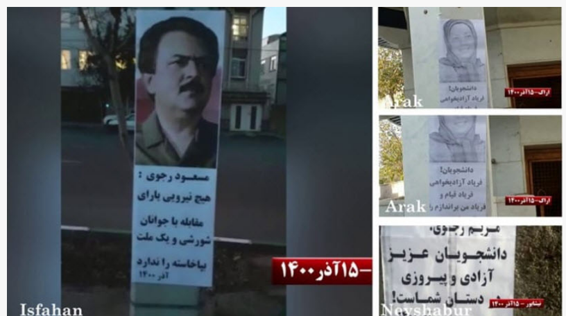
Isfahan, Arak, Neyshabur – Activities of the Resistance Units and supporters of the MEK – "Massoud Rajavi: No force can confront the defiant youth and a rising nation" – December 6, 2021

(PMOI / MEK Iran) and (NCRI): "Maryam Rajavi: Dear students, liberty is in your hands," "Hail to the brave students who will not give up until the overthrow of the ruling theocracy in Iran," Let's spread the Resistance Units everywhere throughout the country,