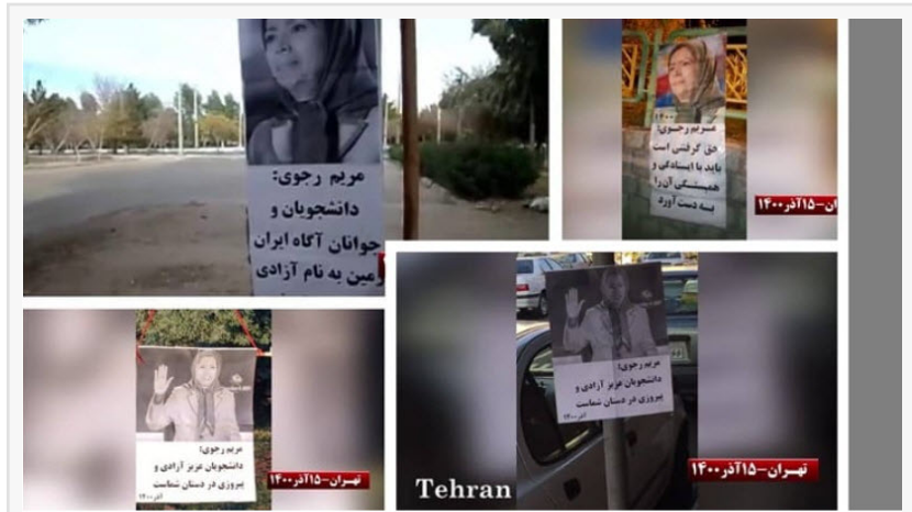
Tehran – Activities of the Resistance Units and supporters of the MEK – "Maryam Rajavi: We have to obtain our rights. It will only be achieved with perseverance and unity" – December 6, 2021

The slogans read: "Long live the memory of the students martyred in the 1988 massacre,"