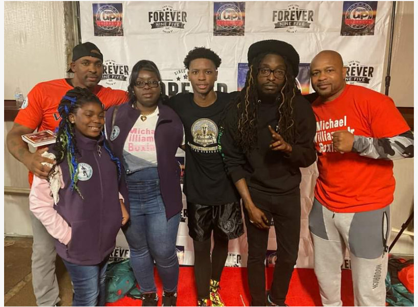
Team Williams and Roy Jones Jr