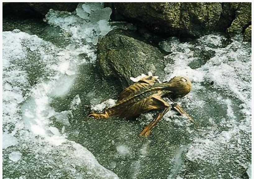
Ötzi the Iceman frozen into the glacial ice

Ötzi the iceman's adventure takes him to the modern era, where his observant soul tries to comprehend why it remains tethered to the frozen mummy, as well as to make sense of a technologically advanced world. The story then returns to 3300 BCE, to the life and times of clan chief Bhark as he lives with his family in a peaceful village upon stilt homes clinging to the shore of the great Lake Neith, located in the shadows of ominous Similaun Mountain.