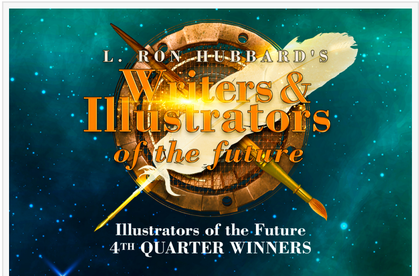
The 4th Quarter Illustrators of the Future Contest winners

The award-winning writers and illustrators will be flown out to Hollywood for a week-long workshop with Contest judges, some of the biggest names in the field, plus a lavish awards ceremony.