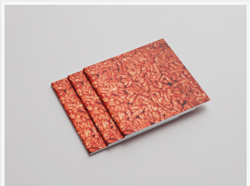
Make it Red Cover