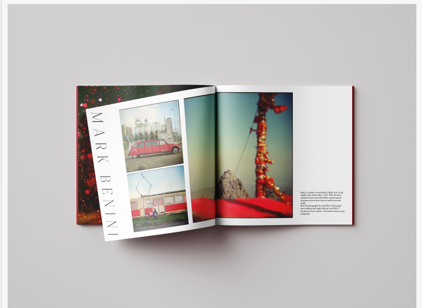
Page Two, Make it Red