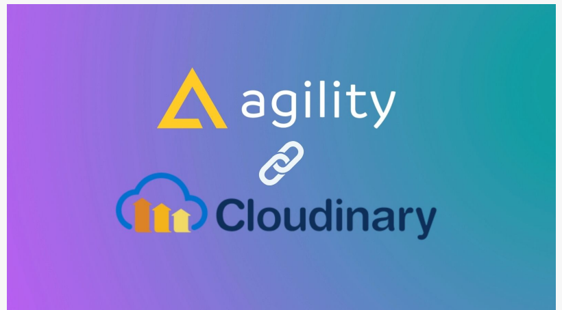
Agility CMS and Cloudinary Integrate

TORONTO, ONTARIO, CANADA, December 14, 2021 / EINPresswire.com/ -- Agility CMS , a leading API-first headless CMS, has announced its partnership with Cloudinary , the end-to-end media management platform.