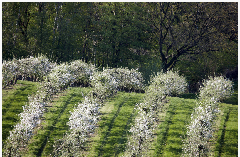
Lake Chelan, Washington

From the fruit to the packaging, sustainability is in our DNA