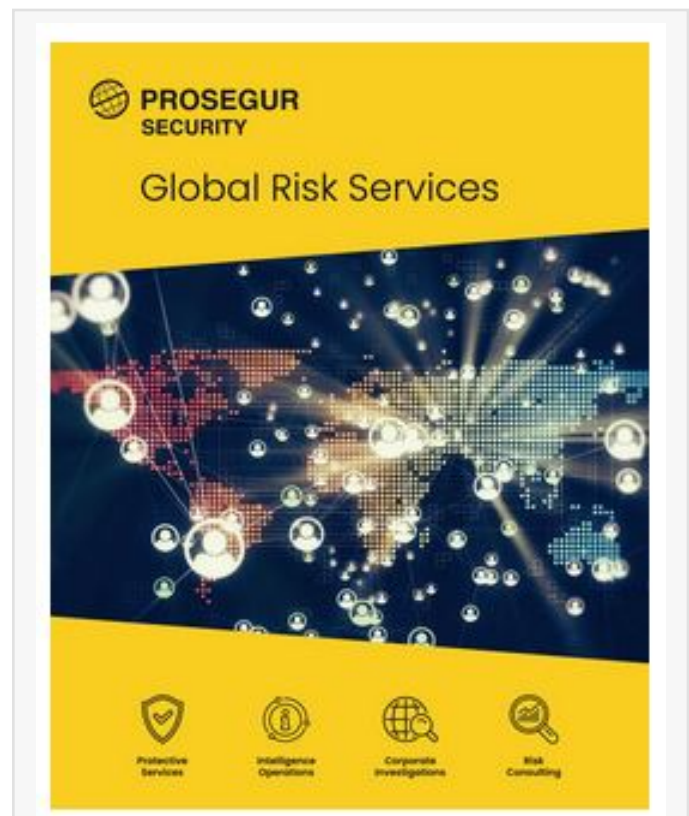
PROSEGUR GLOBAL RISK SERVICES