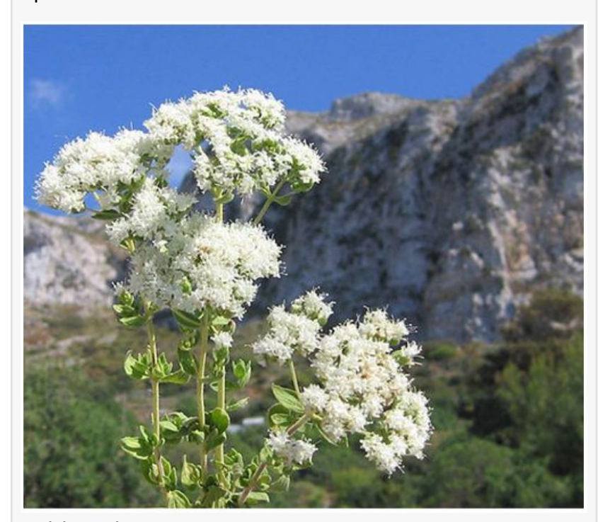
Wild Mediterranean Mountain-grown Oregano

This dynamic trio of books is available as an ebook for immediate reading and printed copies are available in softcover. For more information and to order the books and natural medicines, visit <a href="https://www.cassingram.com">www.cassingram.com</a> or call 800-295-3737.