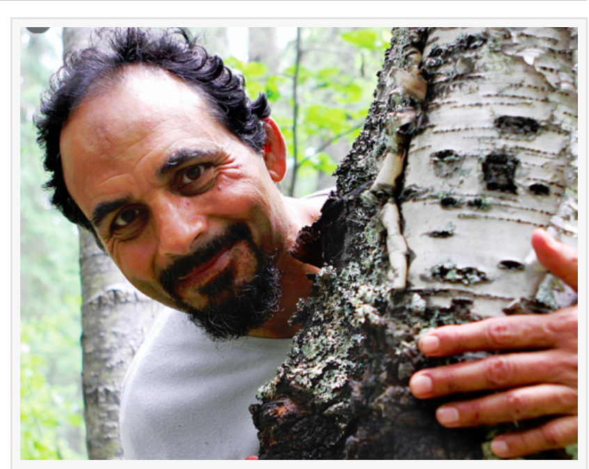
Dr. Cass Ingram - The Wilderness Doctor

LAKE FOREST, IL, UNITED STATES, December 15, 2021 / EINPresswire.com/ -- <u>Dr. Cass Ingram</u>, author and medicinal plant researcher, reveals how to boost the immune system to its highest level using raw wild natural medicines in a special edition 3-pocketbook Christmas Combo. The <u>3-pocketbooks</u> are" Health Benefits of Wild Oregano Oil," "Health Benefits of Black Seed," and "How to Survive Forced Vaccinations" – an ideal