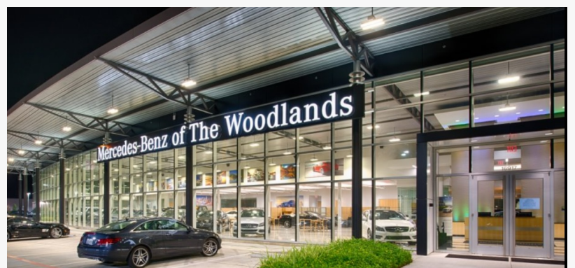
16917 I-45, Conroe, TX 77385

THE WOODLANDS, TEXAS, UNITED STATES, December 15, 2021 /EINPresswire.com/ -- The team at Mercedes-Benz of the Woodlands supports the community through sponsorships, contributions, and charitable donations. The dedicated staff shares gratitude with the community via unwavering support and ongoing involvement.