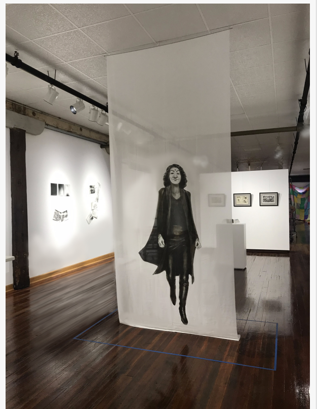
Installation comprising of sheer fabric printed with large-scale drawing of Nirbhaya Superheroine.

Knowing the dynamic, untapped potential of Indian women, expect a revolution.