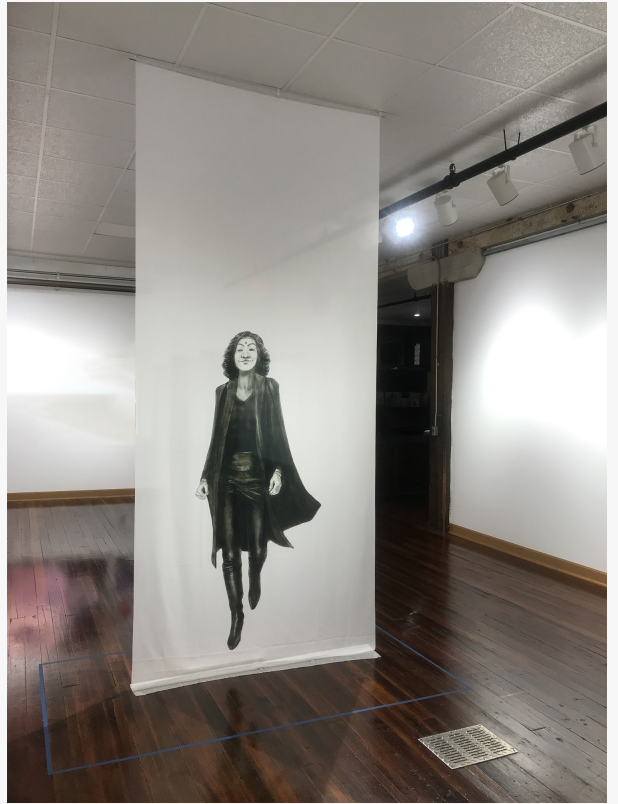
Installation comprising of sheer fabric printed with large-scale drawing of Nirbhaya Superheroine.