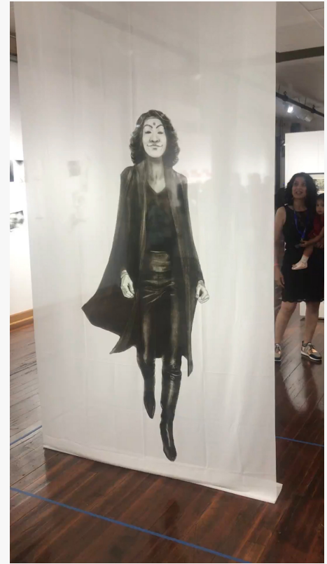
Installation comprising of sheer fabric printed with large-scale drawing of Nirbhaya Superheroine.