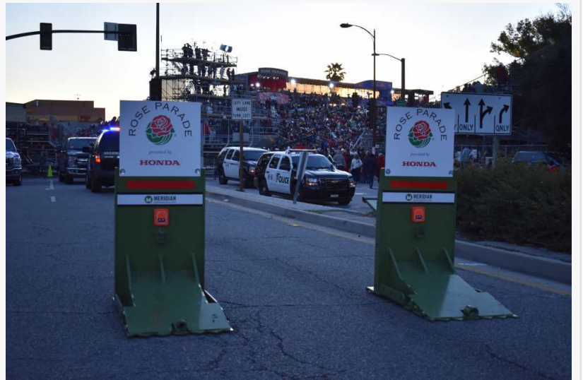
TV Corner Rose Parade