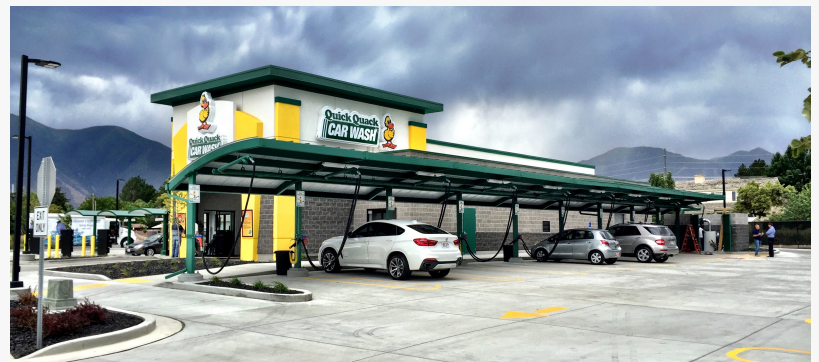
Free Vacuums for Customers