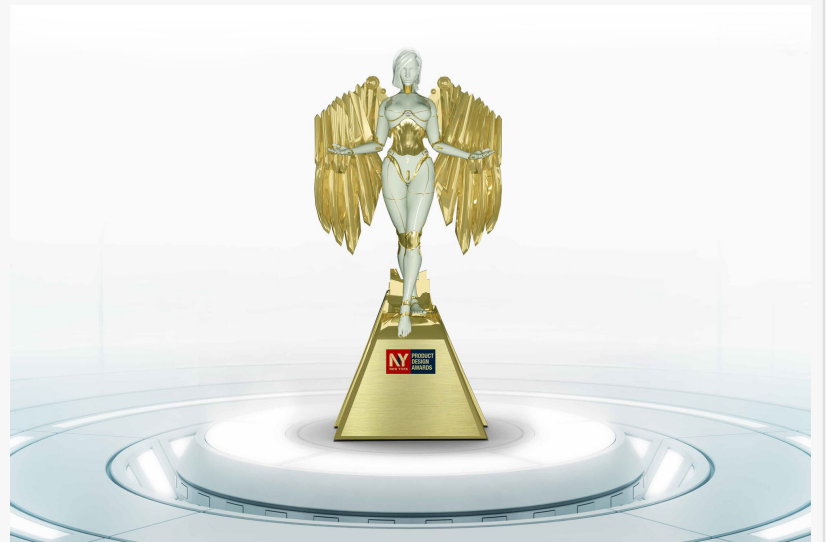
NY Product Design Awards Statuette