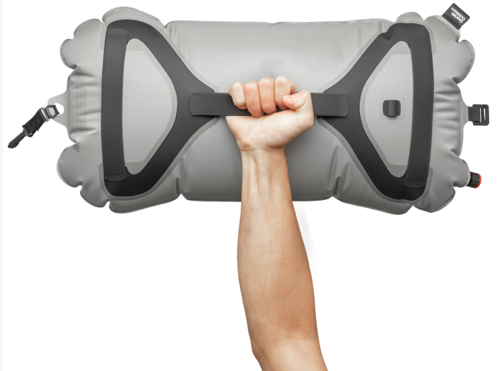
Gearlab Outdoor's Rolling Float Wins "Best Kayaking Accessory 2022" by Paddling Magazine