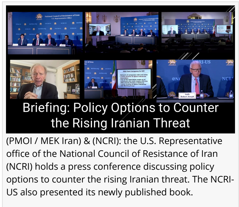
(PMOI / MEK Iran) & (NCRI): the U.S. Representative office of the National Council of Resistance of Iran (NCRI) holds a press conference discussing policy options to counter the rising Iranian threat. The NCRI-US also presented its newly published book.

The NCRI-US also presented its newly published book "IRAN: IRGC's Rising Drone Threat; A Desperate Regime's Ploy to Project Power, Incite War." Renowned American experts and politicians attended this event. This page will be updated with the latest remarks on this event.